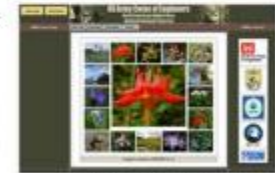
A presentation given during a webinar.

If you haven't used Go To Webinar before or you just need a refresher, please view our guide prior to the webinar here .