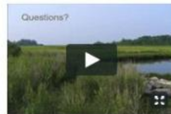
Part 6: Questions/Discussion