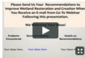
Part 5: Questions/Discussion