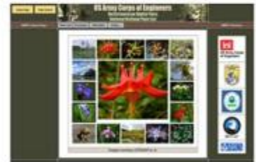
A presentation given during a webinar.