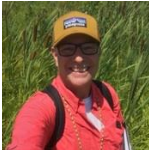
Robert Parker Olsson Associates