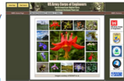
A presentation given during a webinar.

ASWM Member webinars are generally held the fourth Wednesday of the month unless the date and time